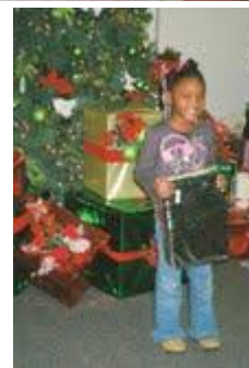
ANGEL TREE 2010

1,500 children given gifts and families of inmates ministered to by local churches in Western New York this past year. Two church parties above served 400 Angel Tree children. Many received Christ.